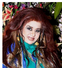
By: Shahnaz Husain

Many people skip applying sunscreen during the monsoon season because they believe the dark, grey skies won't have the same damaging effect as a bright summery one.